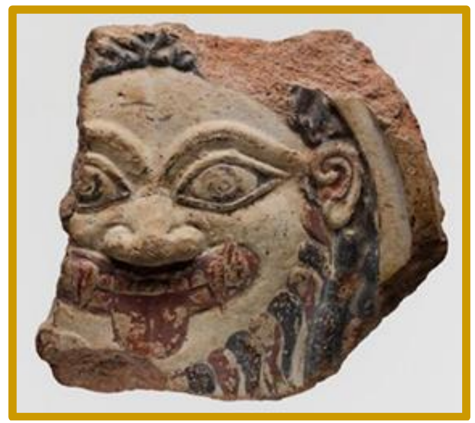
Medusa, South Italian, ca. 540 BCE 2,540 years ago