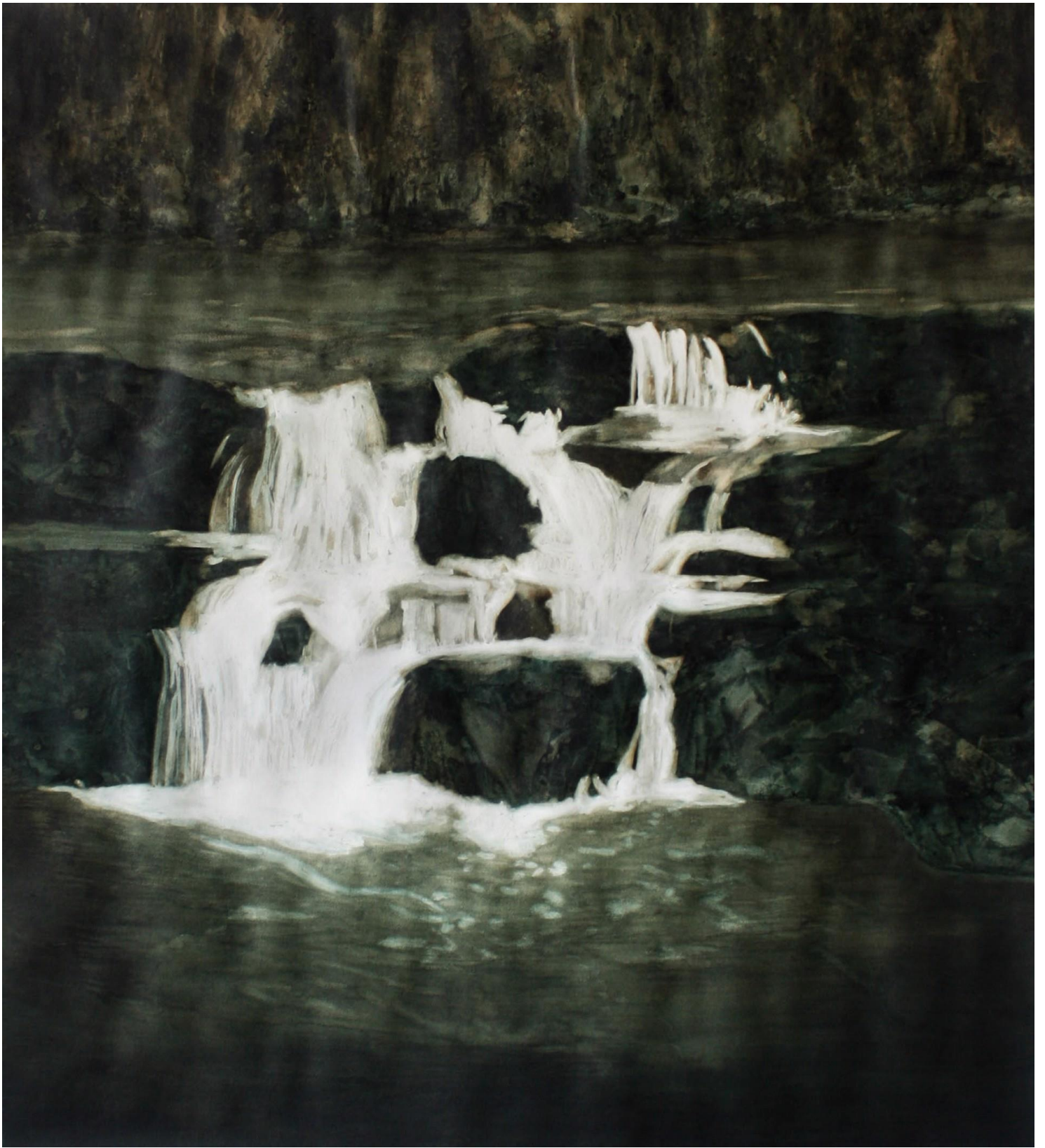
Ripley Whiteside, Cascade 3 2020, walnut ink and watercolor on paper, 47 x 42 in.