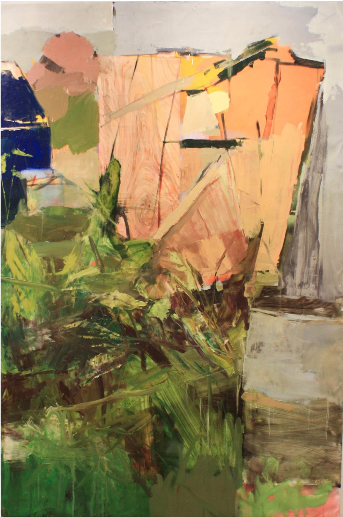
Georganna Greene, Maine Overgrowth 2020, acrylic and oil on canvas, 72 x 48 in