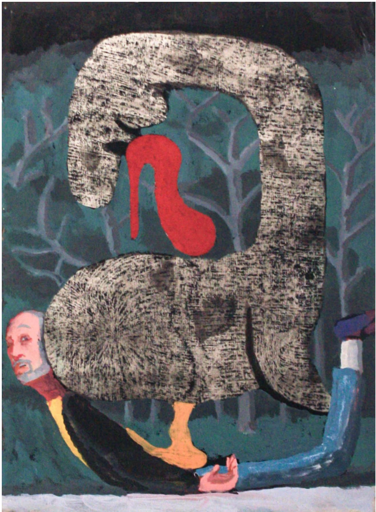
Matt Christy, Untitled (duck) 2021, oil pastel and gouache on paper, 12 x 9 in.