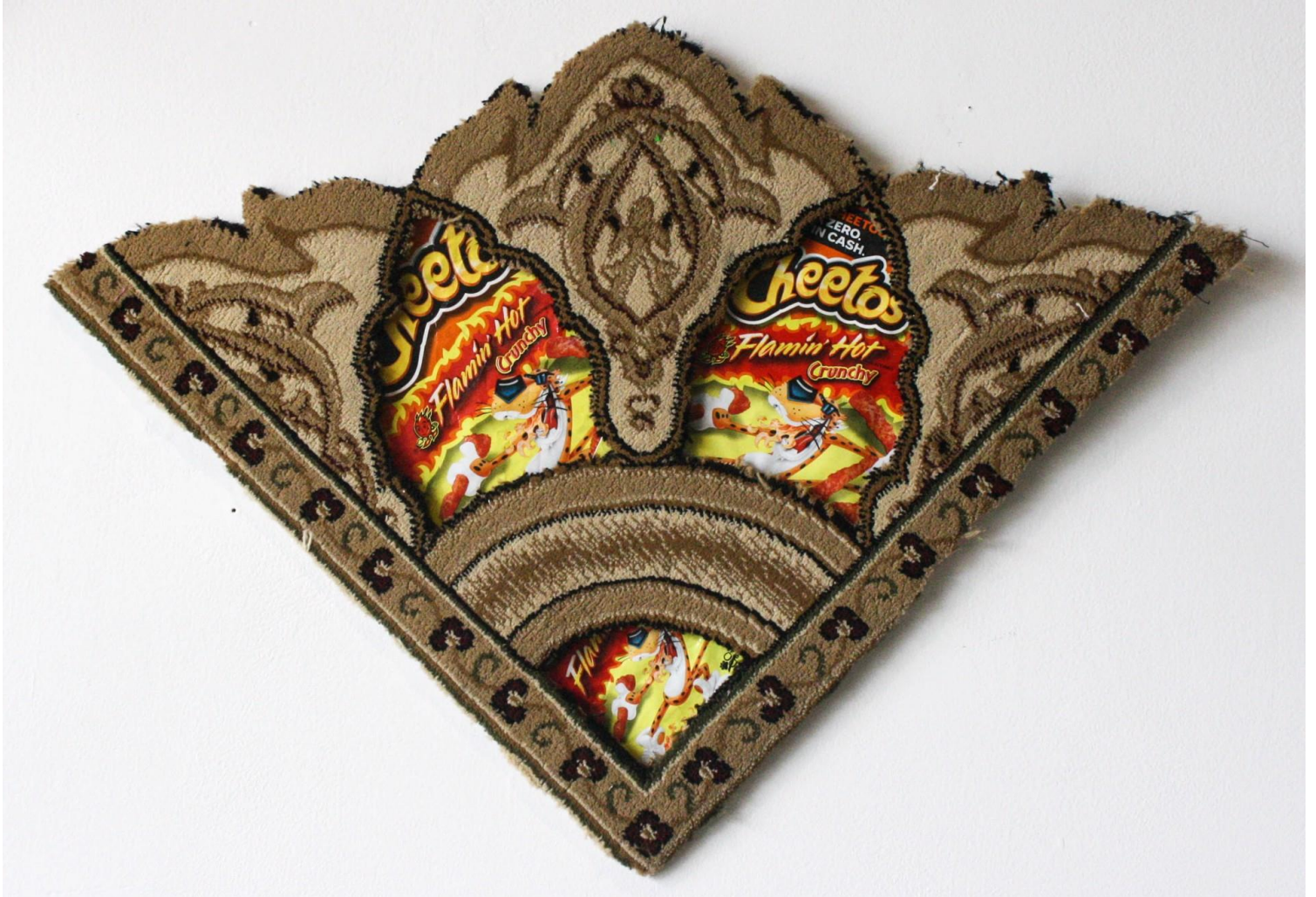
Nuveen Barwari, Flaming Hot 2019, rug cut-out, recycled Hot Cheeto bags, 20 x. 28 in