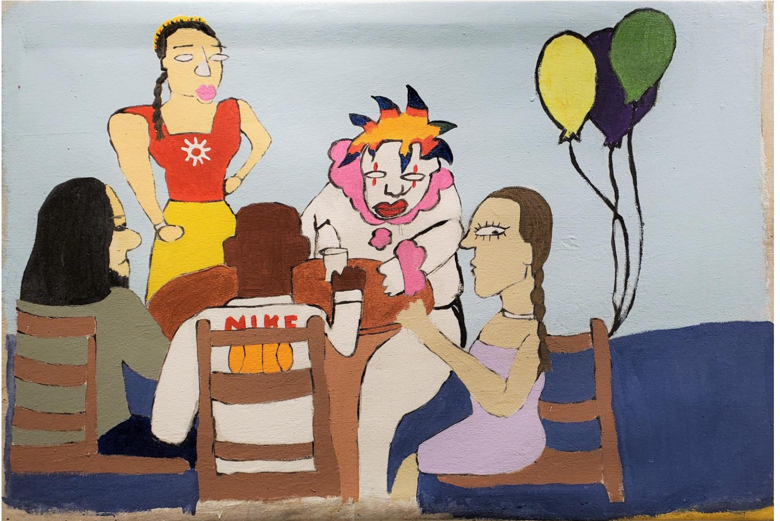
Marlos E'van, Soir Bleu 2021, oil, acrylic, oil stick on canvas, 32.50 x 49 in.