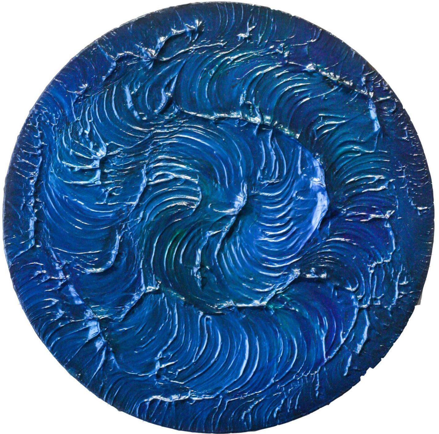
Ashanté Kindle, Softly, tell me would you stay #7 2021, acrylic on canvas, 12 x 12 in.