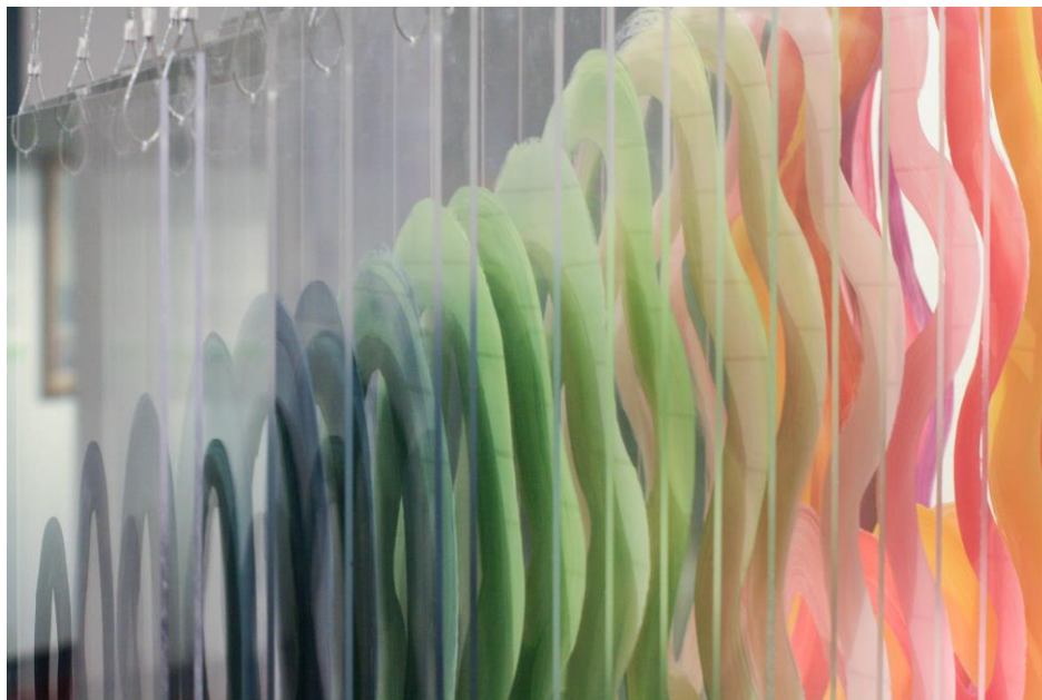
Duncan McDaniel, Zephyrus Rising 2022, acrylic on acrylic, 36x16x22 in.