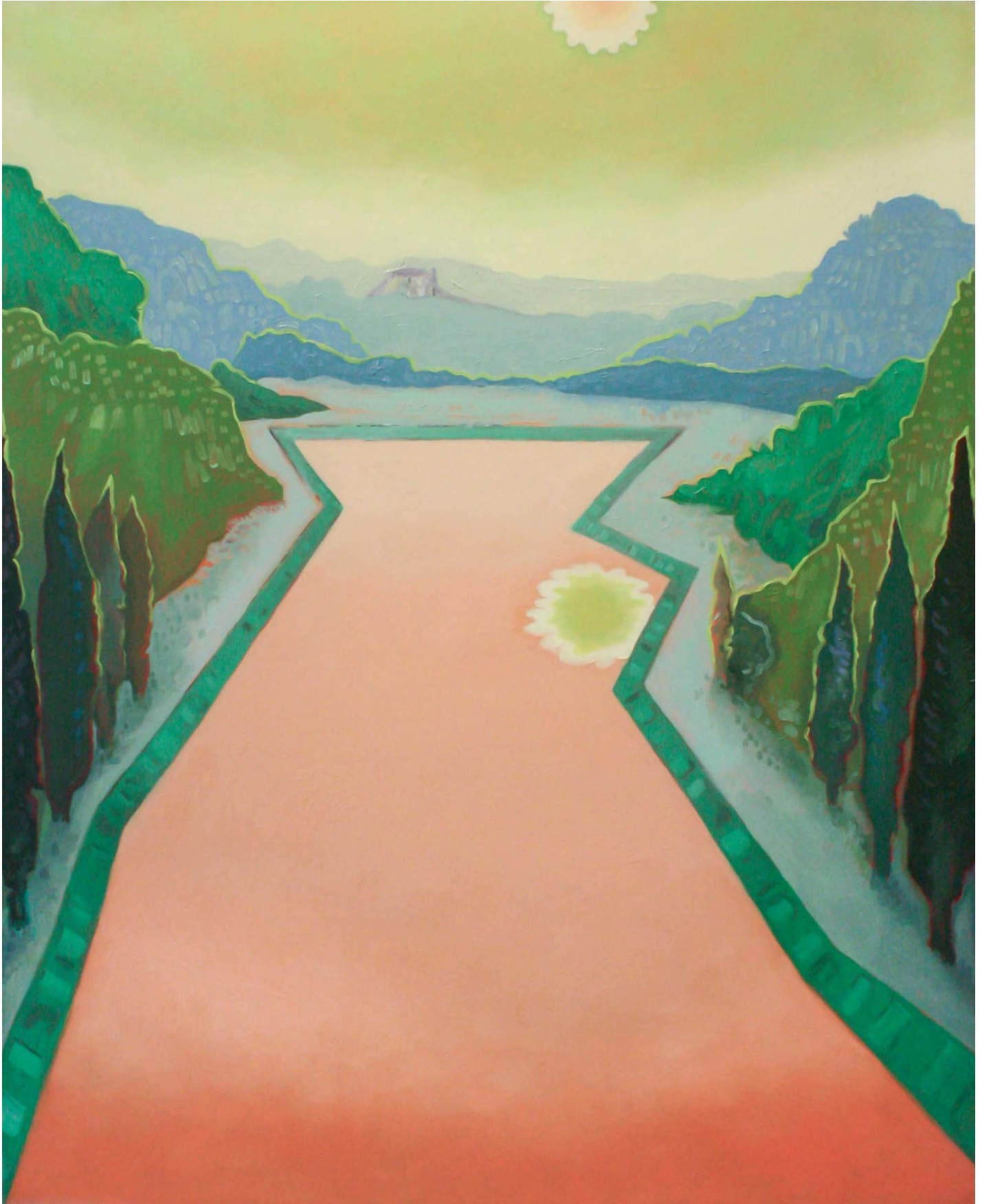
Dana Oldfather, Warm Lake 2021, oil on panel, 30 x 24 in.