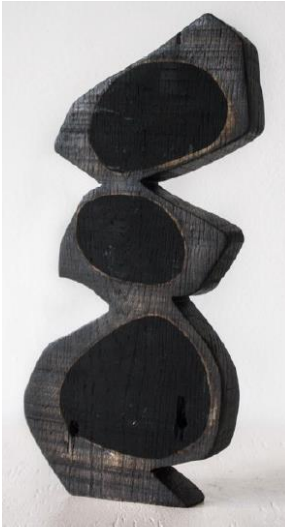
Lindsay Davis, Shaped Shadow 3 2021, wood, fire, & wax, 34.50 x 11 x 1.50 in.