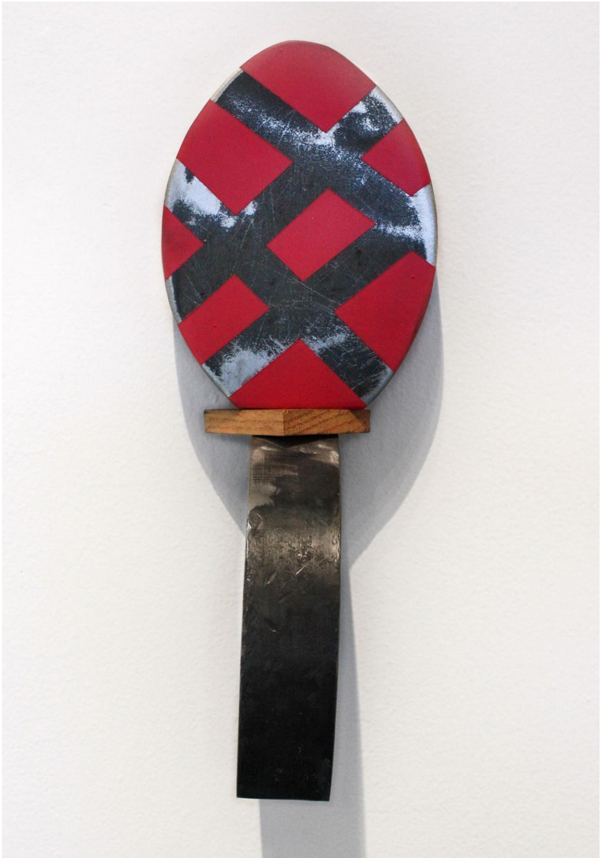
Desmond Lewis, Outreach 2020, forged steel, wood, & spray paint, 13 x 5 x 5 in.