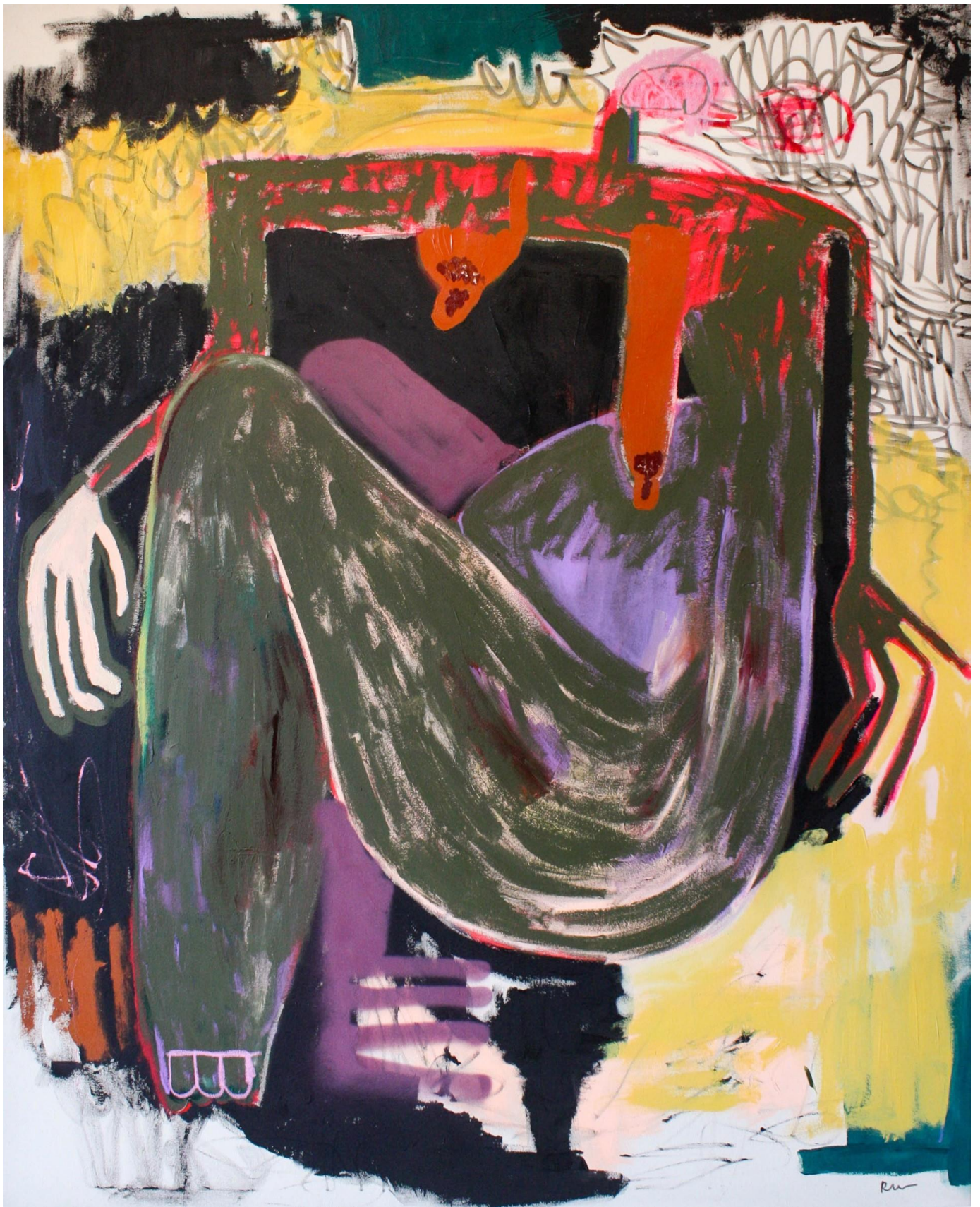
Reneesha Mccoy, Puzzle 2021, acrylic, gouache, paint marker, & spray paint on canvas, 60 x 48 in.