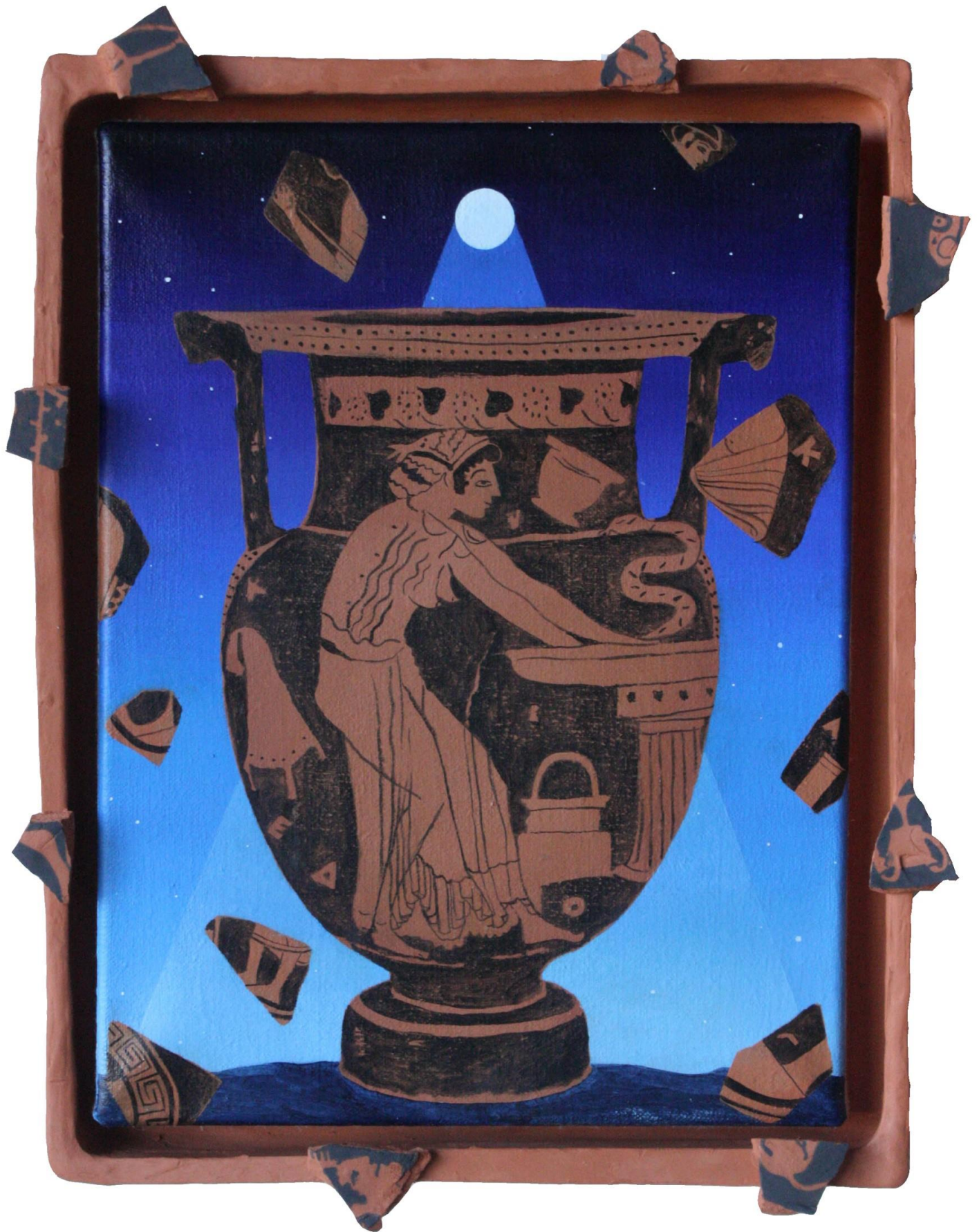
Emily Weiner, Cassandra 2022, oil on linen in terracotta frame, 13.75 x 10.50 x 1 in.