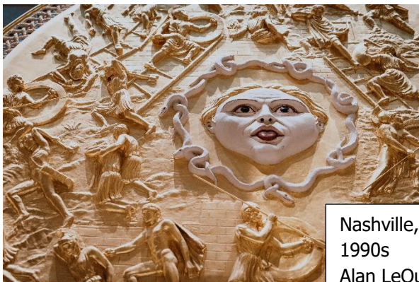
Nashville, TN 1990s Alan LeQuire