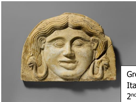
Greek, South Italian, Tarentine, 2 nd half of the 5 th century BCE