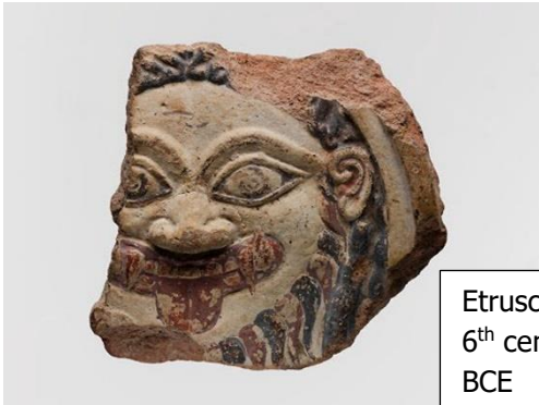
Etruscan, 6 th century BCE