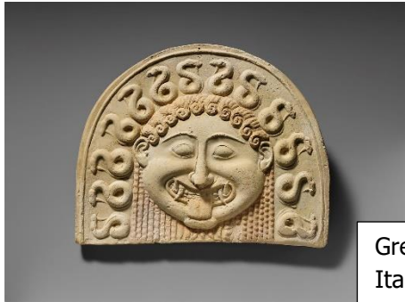
Greek, South Italian, Tarentine, ca. 540 BCE