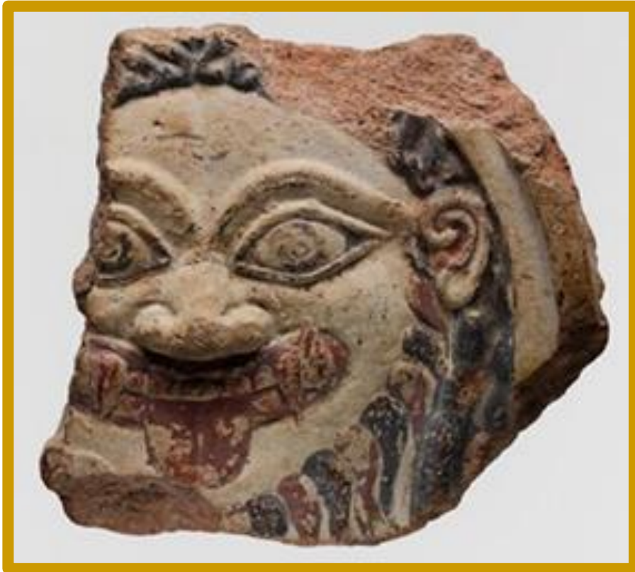
Medusa, Etruscan, 6 th century BCE 2,600 years ago